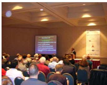
Session at the 2005 Nutrition and Aging Symposium

review program updates at www.americanaging.org/2006.html